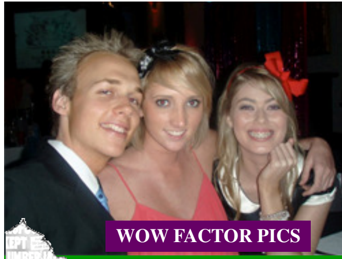
WOW FACTOR PICS