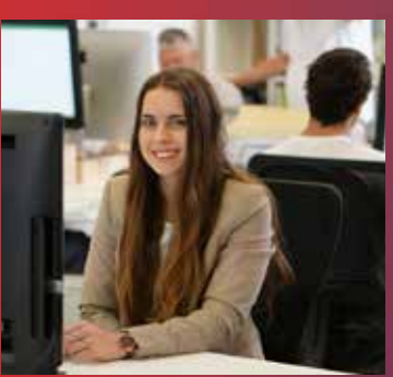
Industry Training (Work Integrated Learning)

Small interactive classes mean you will develop strong relationships with fellow students and teachers