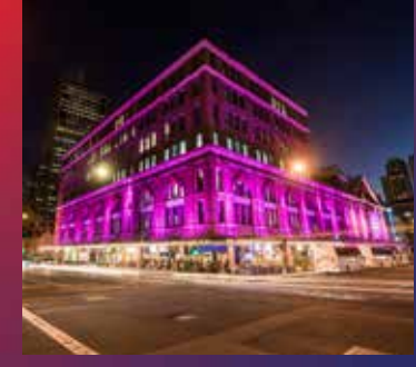
City CBD Campus

Study in the iconic 'castle on the hill' within walking distance to Manly and Shelly beach.