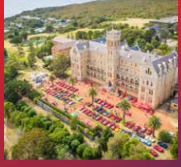
'Castle' by the Beach

Choose to make the most of college life by living in student accommodation on or off campus.