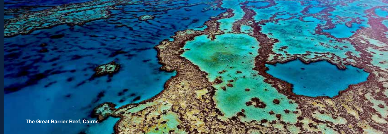
The Great Barrier Reef, Cairns