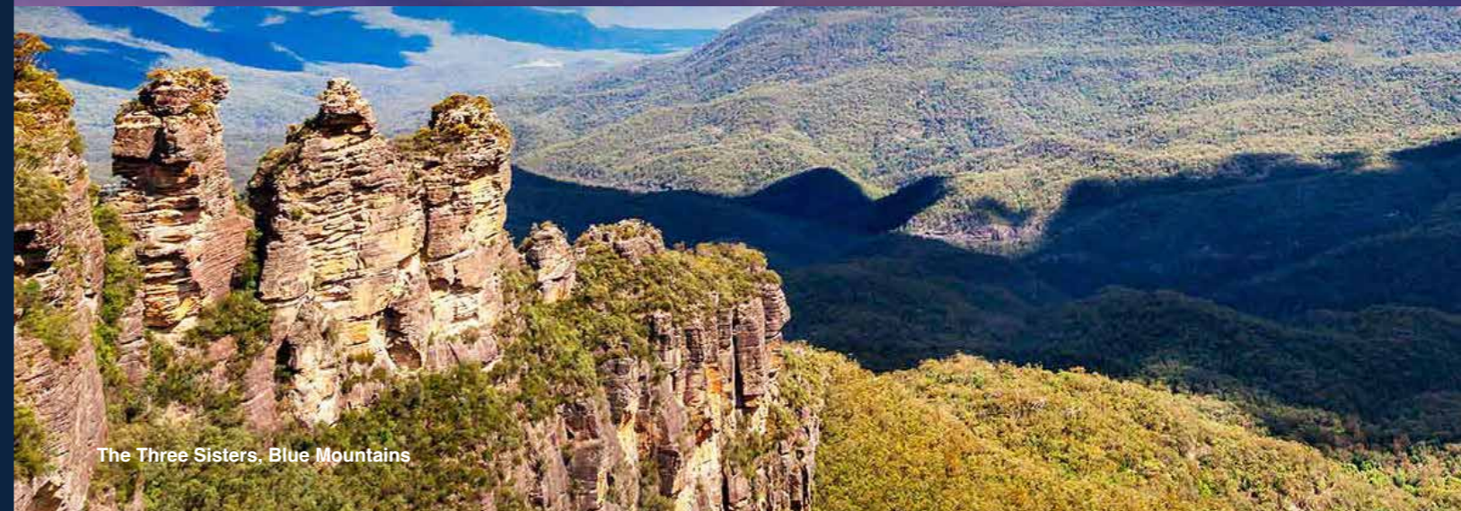
The Three Sisters, Blue Mountains