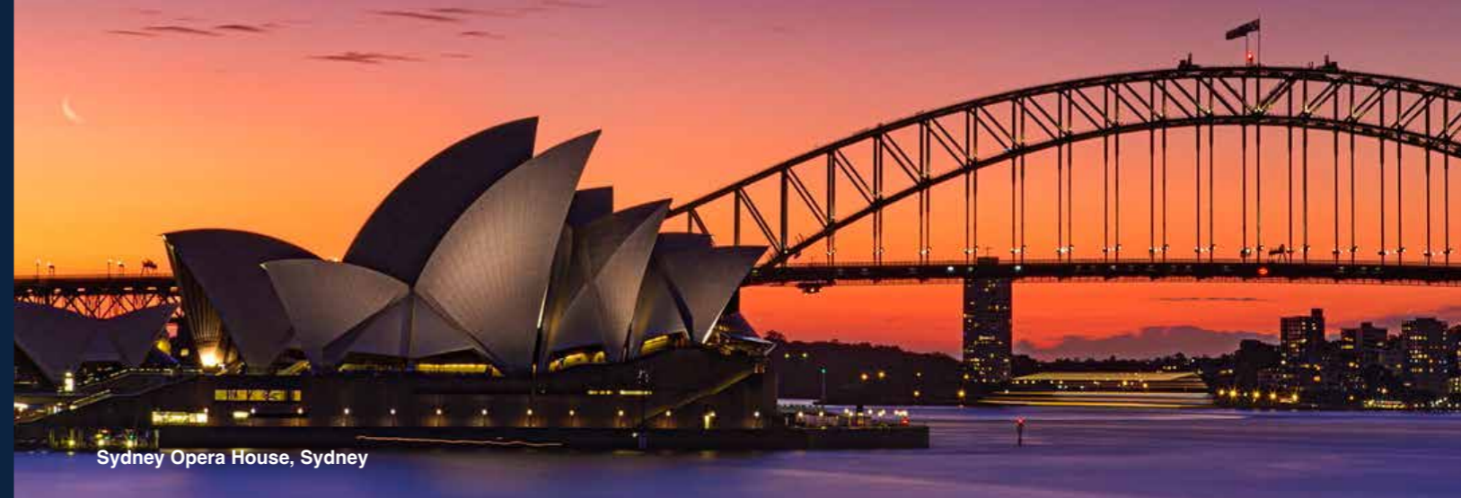
Sydney Opera House, Sydney