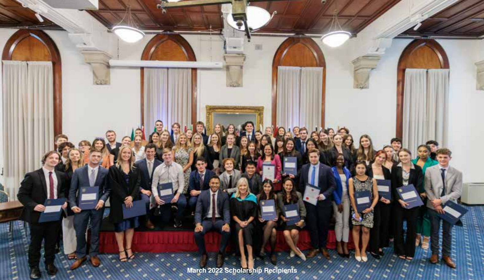
March 2022 Scholarship Recipients